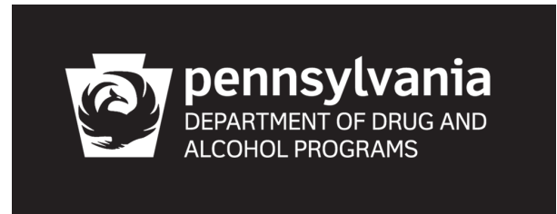
One Color Logo